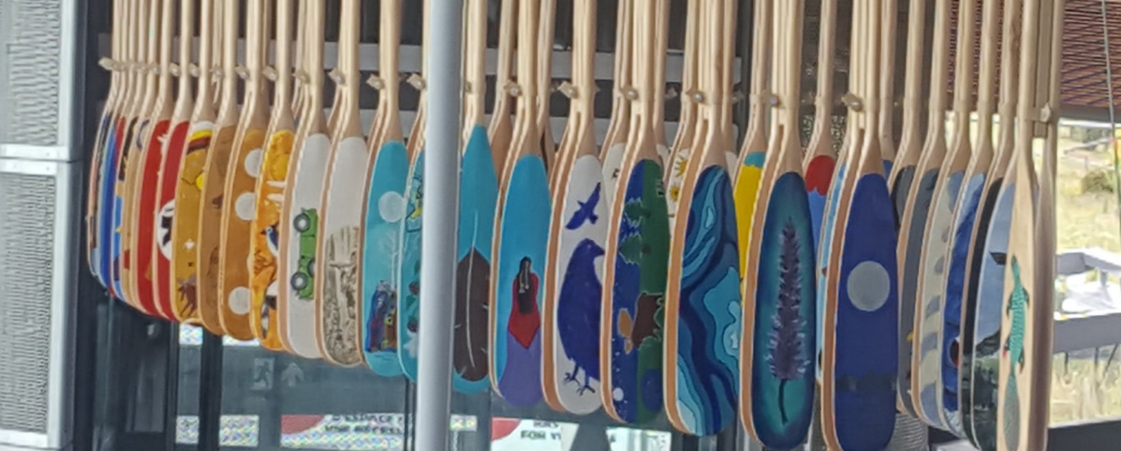
Figure 2. Occupying a place of prominence in the Pimisi Transit Station concourse, the installation Māmawi: Together features 100 paddles, each hand-painted by Algonquin-Anishinabe artists and arranged in the shape of a canoe on the ceiling of Pimisi station. The piece is inspired by the Algonquin teaching that it takes many people to paddle a canoe. The project was led by internationally known Algonquin artist Simon Brascoupé and includes artists of all ages, children, adults and elders alike from Algonquin communities across Ontario and Quebec.